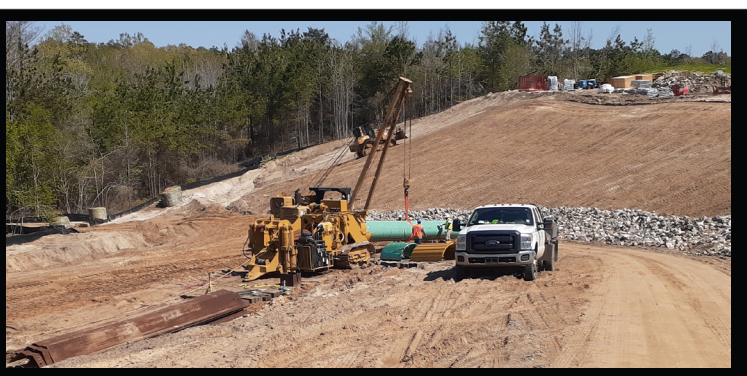
All right reserved Copyright 2020 Created by Chrystal Bates

DMI International Inc 918-438-2213 www.dmiinternational.com